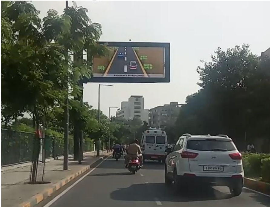
Image of Traffic Information Board with V2X device showing emergency vehicle information